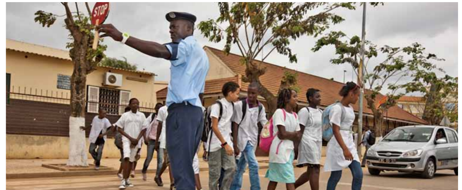
The community and the police work together during the road safety program