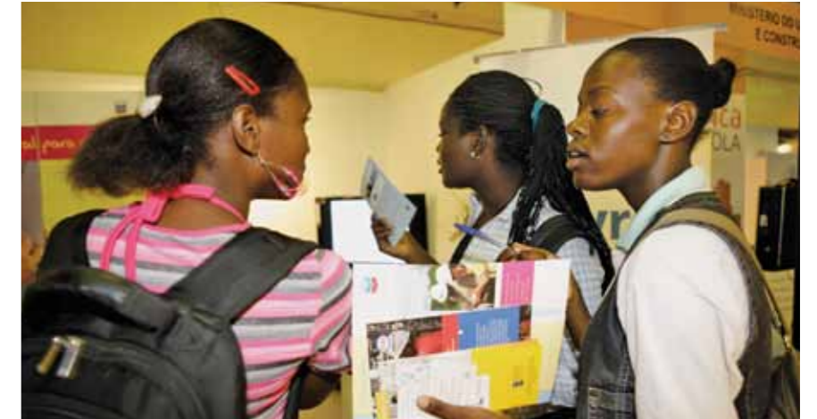
Potential candidates at a job fair

Construction has commenced for teacher resource centers in Luanda and Cunene provinces. The centers will help teachers improve their information technology skills. Each of the centers offers a library of computer