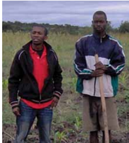
Two farmers from Nova Wangué Farmers' Association