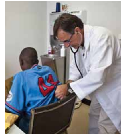
Polio vaccination campaign

The Social Bonus Servindo a Comunidade project trains community health activists to disseminate information and best practices in Malanje Province. The project addresses major public health issues and preventable diseases, such as malaria and HIV/AIDS, and encourages best hygiene practices. The outreach health program is implemented by Africare in the municipalities of Cacuso and Cangandala. The project