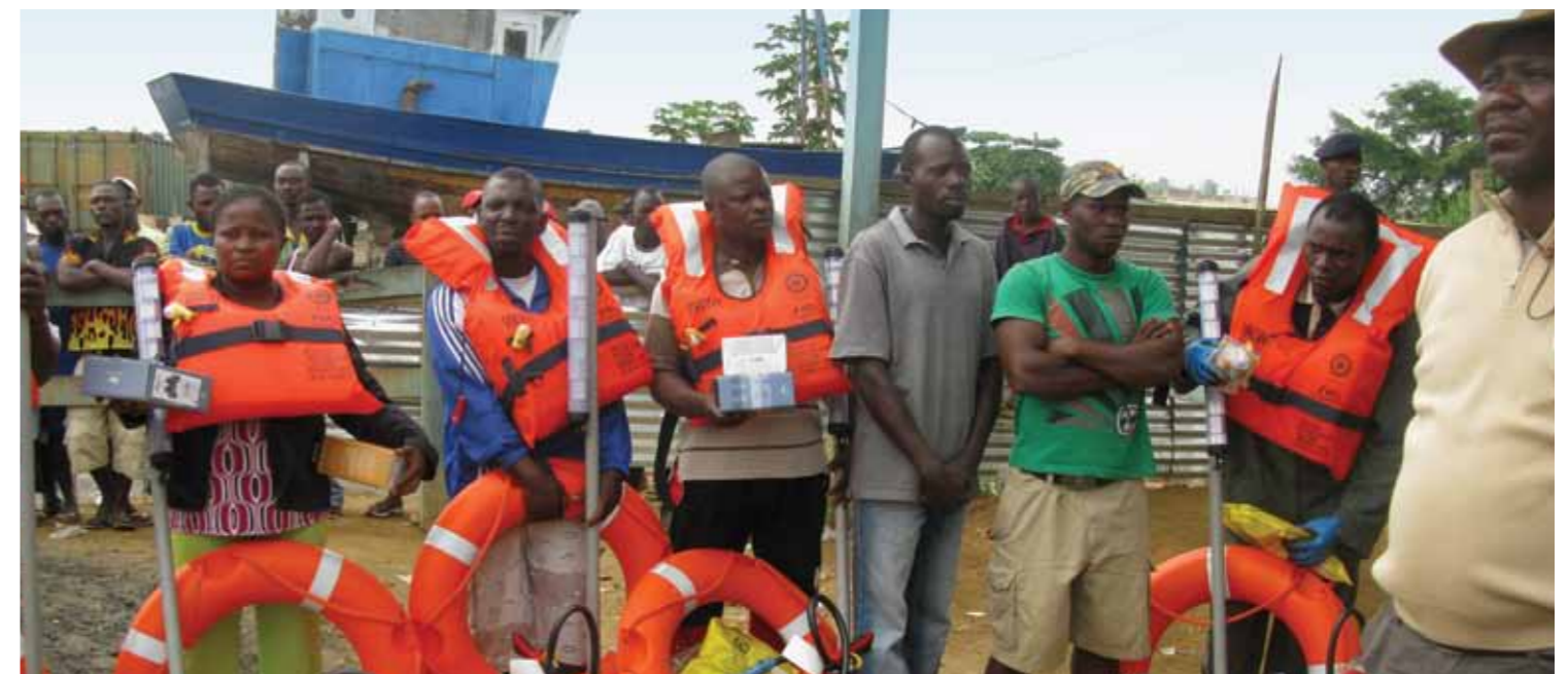
Community members at the equipment donation event of the Cabinda Fishing Sector Project (FiSS)