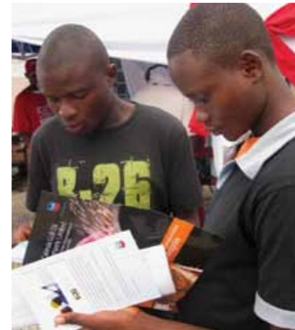
Two attendees at the HIV awareness fair in Cabinda

In 2010, CABGOC continued its commitment to support the government's efforts in the battle against HIV/AIDS and other infectious diseases contracted through blood transfusions, and to help support those infected and affected by the pandemic diseases. The company contributed US$350,000 to the Cabinda hospital blood transfusion services to provide health professional and community training, purchase equipment and