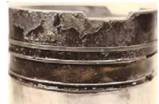
The heavy duty diesel piston is showing severe deposits due to lack of sulfonates.