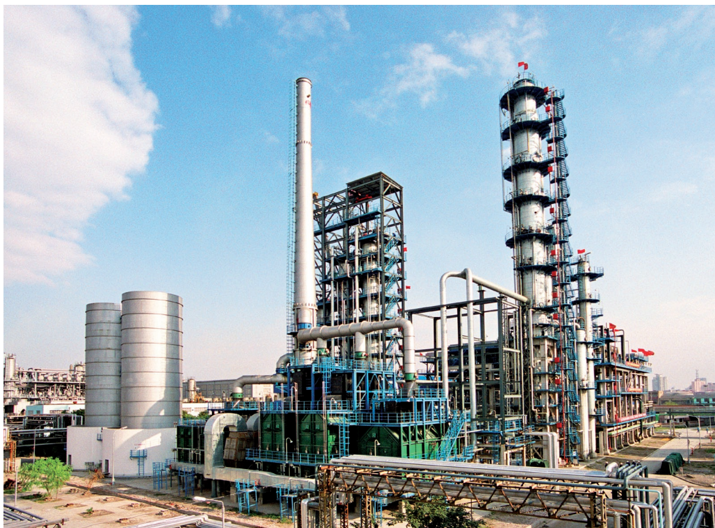
The base oil plant at Sinopec's refinery in Gaoqiao, China, uses Chevron Lummus technology.