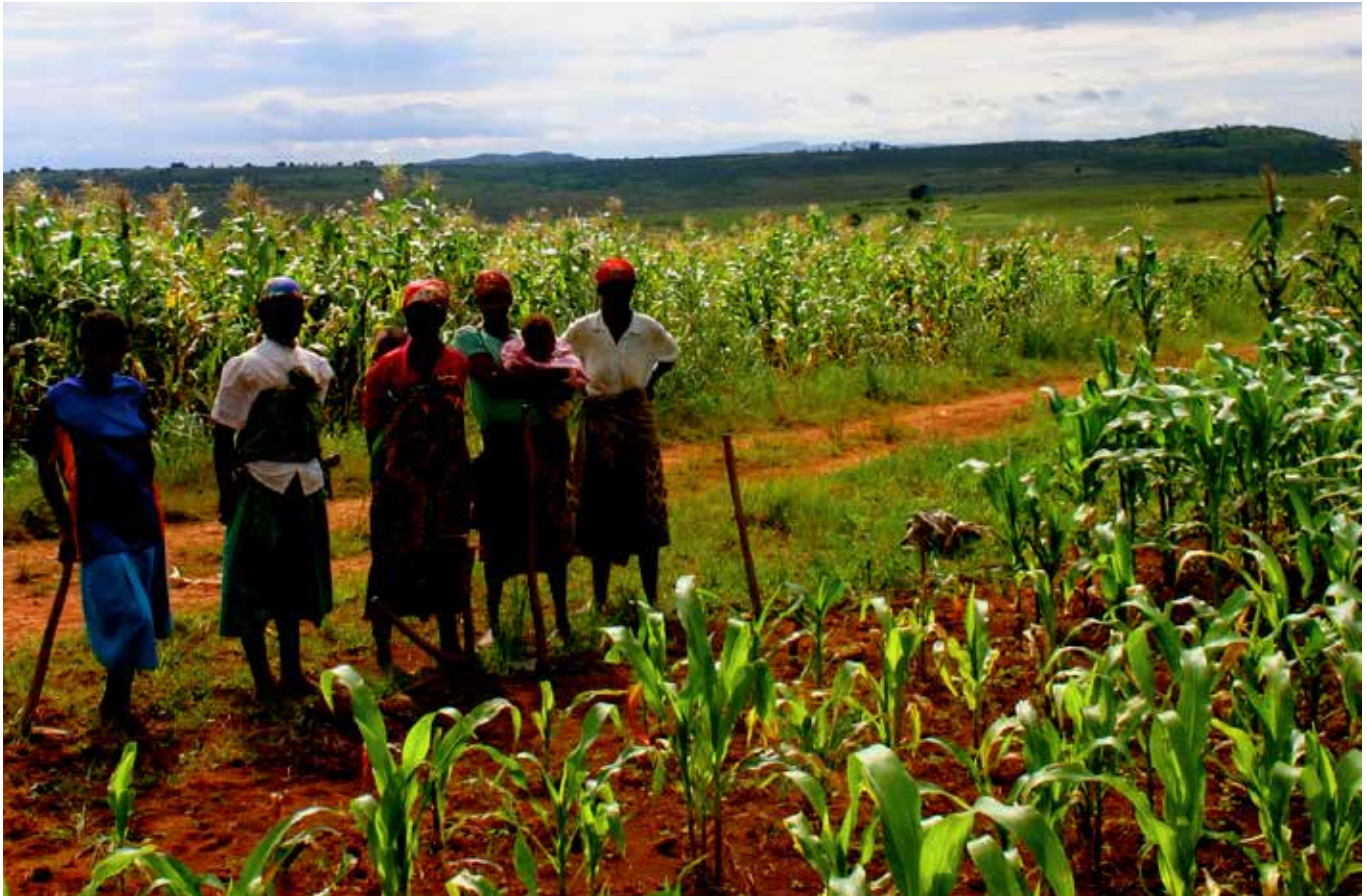
Chevron provides training to farmers on the effective use of water and business management for sustainable production and development.