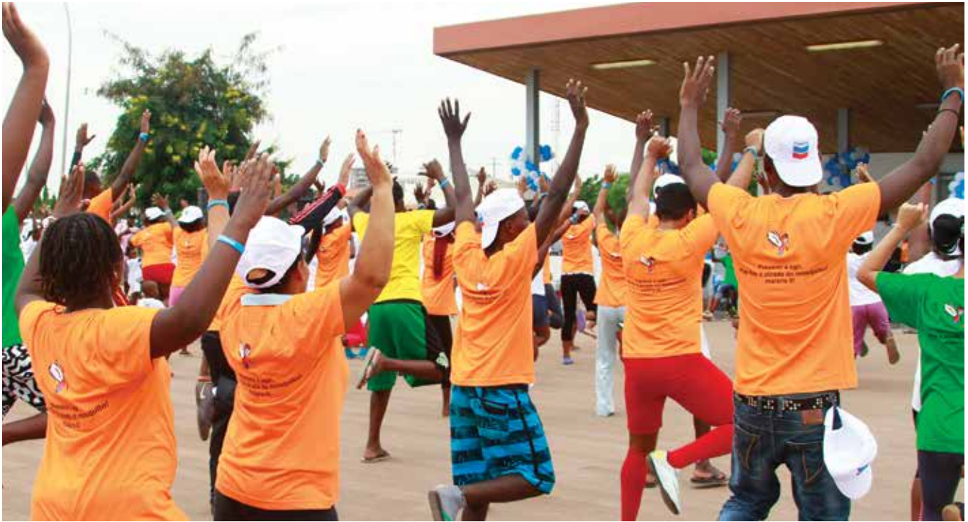
Chevron's activities for employees promote healthy lifestyle and help prevent cardiovascular diseases.

Chevron strives to provide quality medical care to all employees and dependents. The company operates three onshore clinics and seven offshore health centers and provides programs that help employees maintain their health.