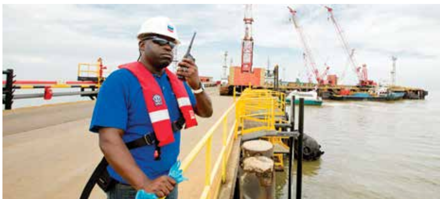
Everyone at Chevron in Angola has the responsibility to use Stop Work Authority if a potentially unsafe situation is observed.

Our focus on safety is designed to reduce the likelihood and severity of unplanned incidents that can affect people or the environment.