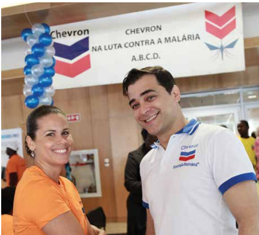
Chevron promotes activities that support Angolan government efforts to control, prevent and eliminate malaria in the country.

The goal of this four-year, US$4 million project is to reduce the effects of sickle cell anemia (SCA) disease in Angola through improved diagnosis, testing and treatment. The program tests new born babies, provides preventive and curative treatment and patient and family consultation, and helps train healthcare workers in the diagnosis and treatment of the disease.