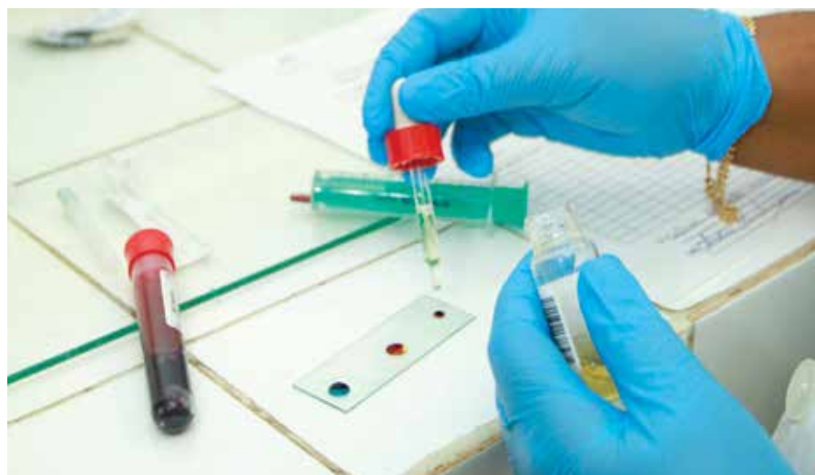
Safe blood programs help treat a wide variety of illnesses in Cabinda.