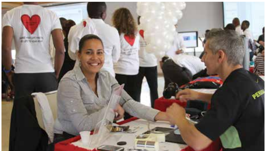
A Chevron employee receives health advice at the Healthy Heart Program event at Chicala, Luanda.