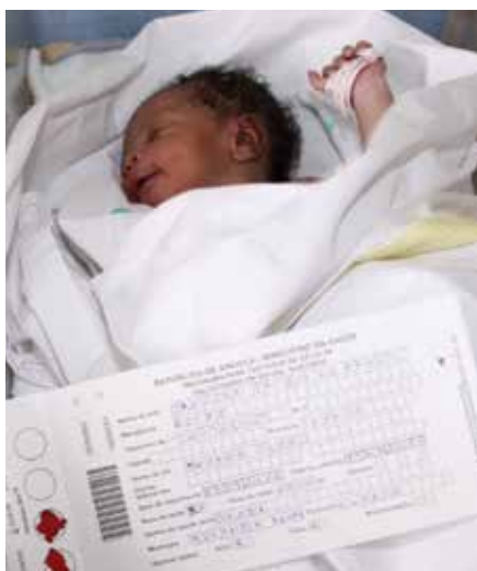
CABGOC invests in programs that improve maternal and child health care.

the blood-borne transmission of infectious diseases such as HIV, Hepatitis B and C and syphilis. Chevron has supported the program since 1991 to ensure access to safe blood transfusions and meet the goals, standards and recommendations of the World Health Organization (WHO) for Africa. Working in partnership with the Angolan National Blood Center and the Cabinda Provincial Secretary of Health, the program has increased the supply of safe blood for transfusion at the Cabinda Central Hospital, Provincial Maternity, Belize, Buco Zau, Chinga and Cacongo municipal hospitals. The Cabinda Blood Bank supplies more than 19,000 transfusions annually.