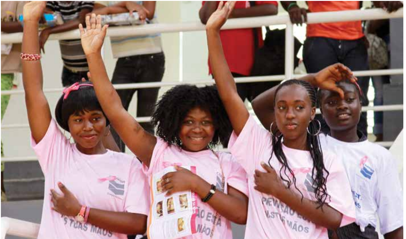
Chevron sponsored the Breast Cancer event in Cabinda to raise public awareness about the disease, treatments and prevention.