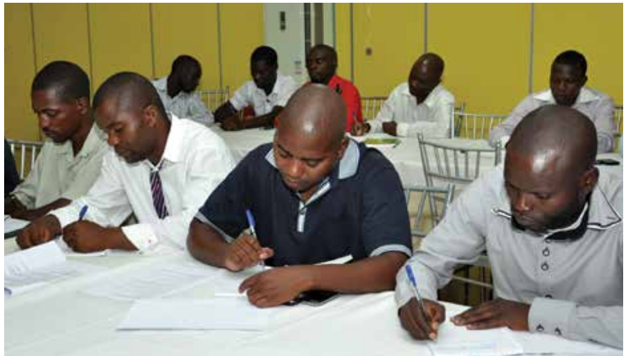
Teachers being trained on entrepreneurship teaching methods.