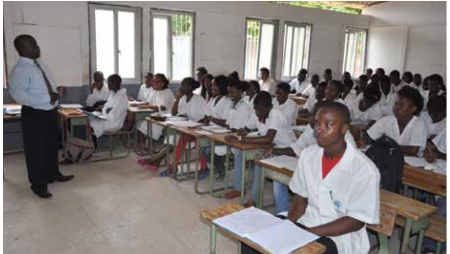
Students currently benefiting from the entrepreneurship program.

More than 10,000 students are enrolled in the program, which also trained 139 teachers and 70 education officials. Currently implemented in 45 schools nationwide, the program plans to expand to 90 schools in 2014.