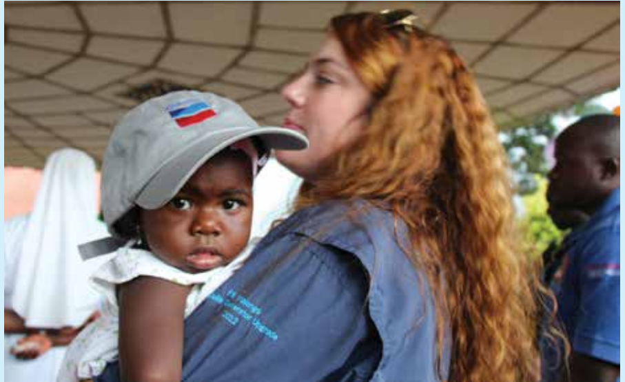
A CVOP volunteer holds a child while visiting an orphanage in the city of Landana in Cabinda.