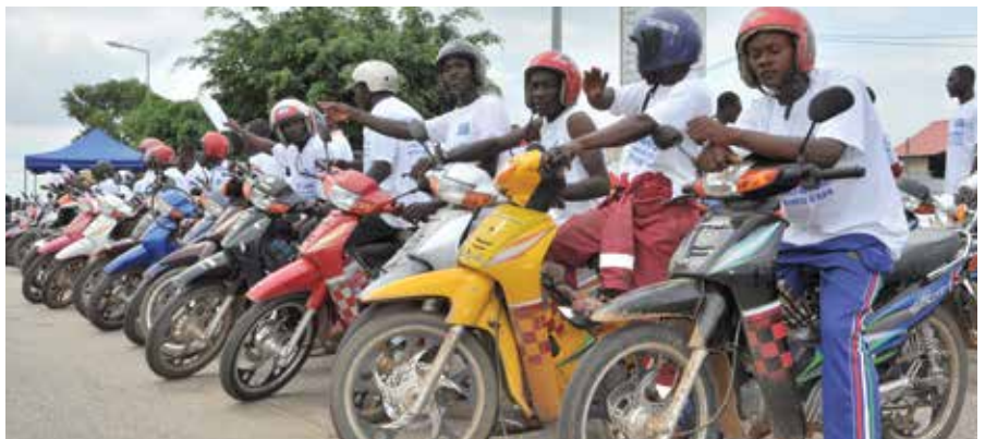
Chevron is helping to educate drivers and pedestrians on best practices to reduce road crashes.