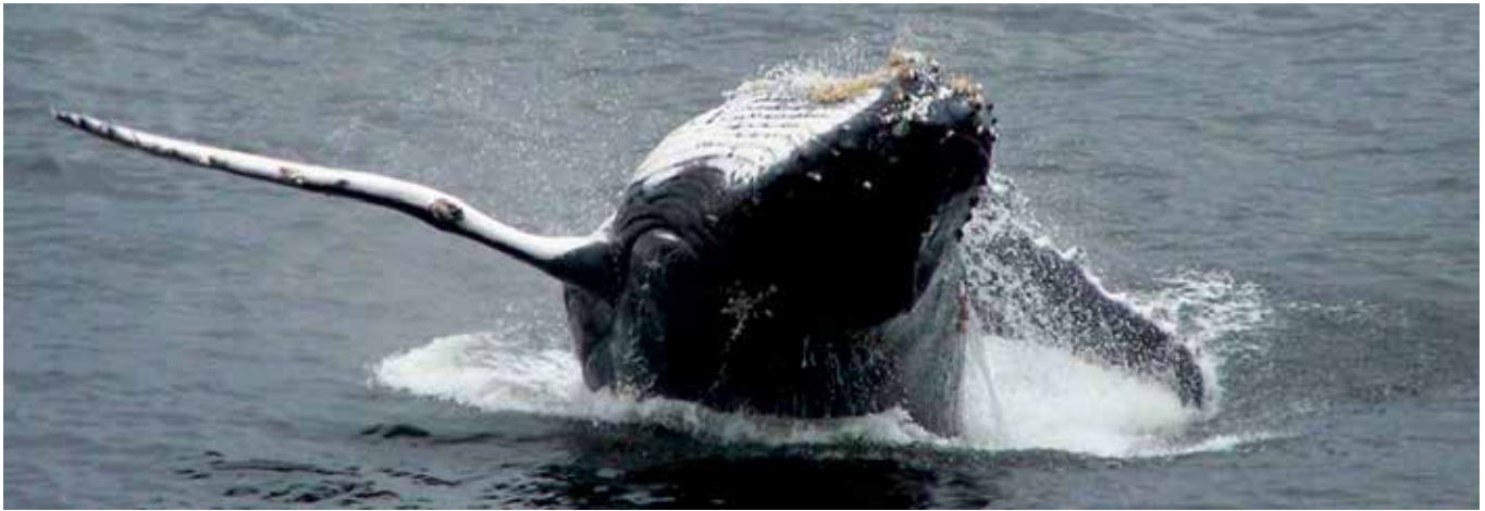
To protect marine mammals, Chevron follows measures consistent with the United Kingdom's Joint Nature Conservation Committee guidelines.