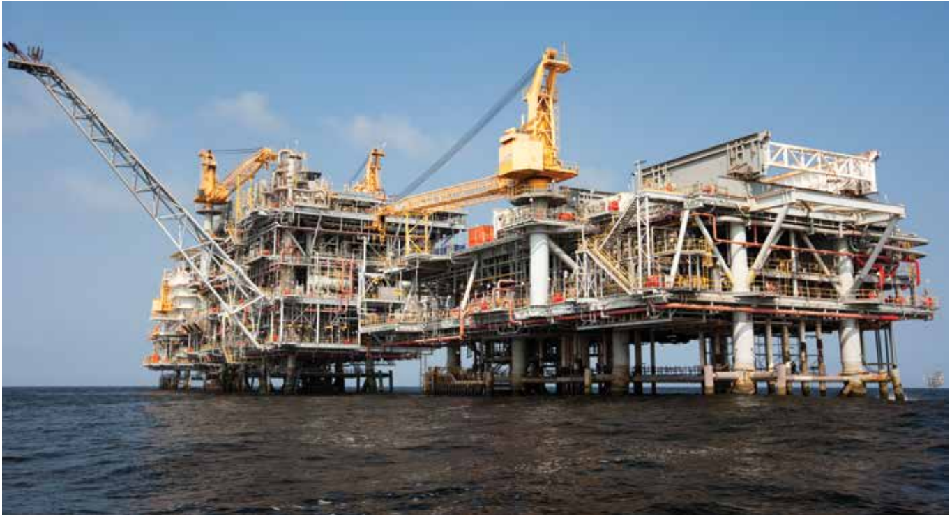
The Sanha Complex is situated in Block 0, approximately 30 miles offshore from the Malongo Terminal in Cabinda.