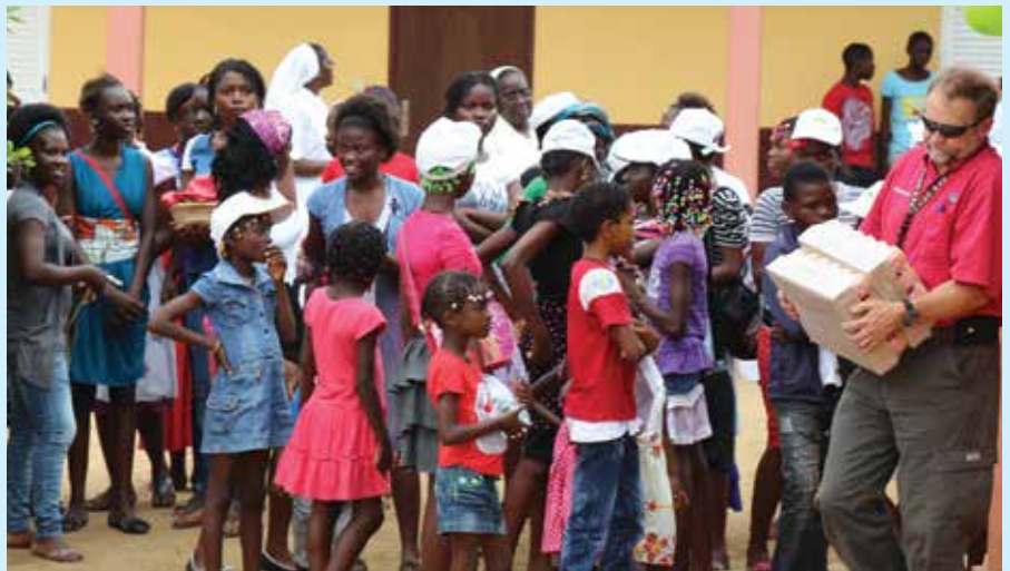
Contributing to the well-being of the communities in Cabinda, CVOP helped to make a difference by donating food to children in need.