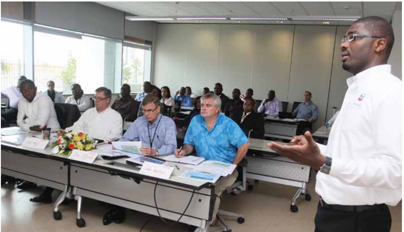
Chevron employees participate in career development training.

Invested in workforce training programs in 2013