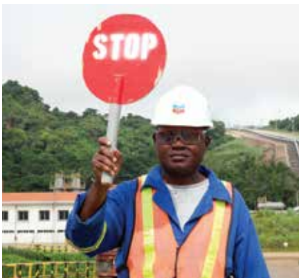
Chevron's policy is to always follow safe work practices to prevent incidents.

poorly maintained roads, Chevron experienced only minor motor vehicle-related incidents, most of which involved slight dents and scratches to vehicles traveling at low speeds in heavy traffic. The number of motor vehicle-related incidents involving Chevron vehicles decreased 17 percent from the previous year. We continue to seek ways to improve our road safety performance record.