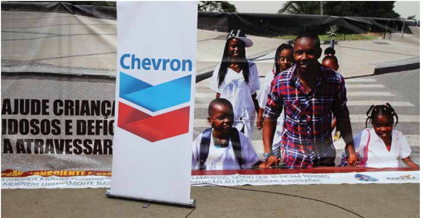
In partnership with Cabinda's Provincial Directorate for Road and Traffic, the objective of the "Arrive Alive" program is to reduce road crashes and fatalities.

Chevron is helping make the roads safer in Angola by working to educate drivers on best practices and by improving basic infrastructure. The campaign is aligned with the Angolan government's policy of ensuring the health and safety of the people, especially children.