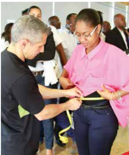
An employee learns how to diagnose obesity.

The Employee Assistance Program (EAP) provides psychological, social, relationship, and work-life balance services.