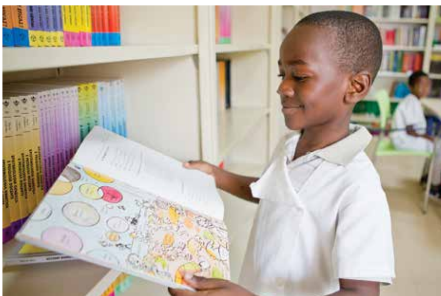
Chevron contributed to the development of teaching and learning processes in Angola.

In its fourth year, the Chevron sponsored National Mathematics Olympics is designed to help improve the quality of both the teaching and learning experiences of the subject and to create a motivating environment. This year, of the 135 students who participated from 17 provinces in Angola,