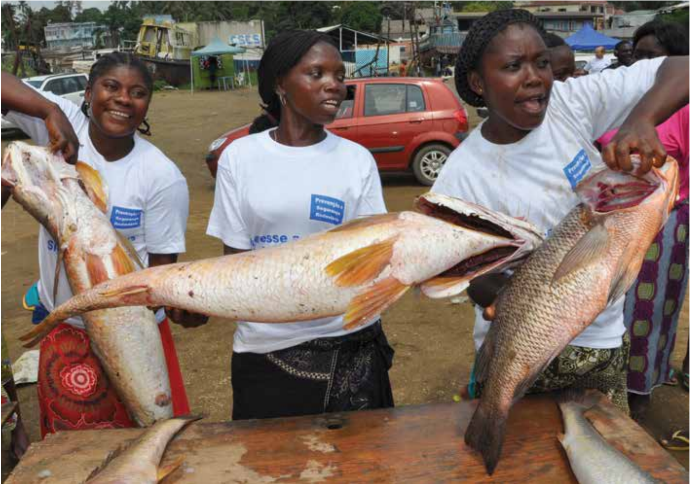
Women fish traders benefited from FISS project funding to help improve economic prospects of the local fishing industry in Cabinda.

Chevron's social investments promote self-sustainability, job creation and economic development among small- and medium-sized businesses in the communities where the company operates.