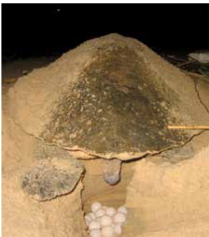
Chevron continues to support safeguarding endangered sea turtles.