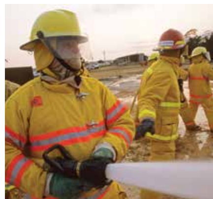
Prevention is the first priority and our employees strive to ensure they are prepared to respond to emergencies.