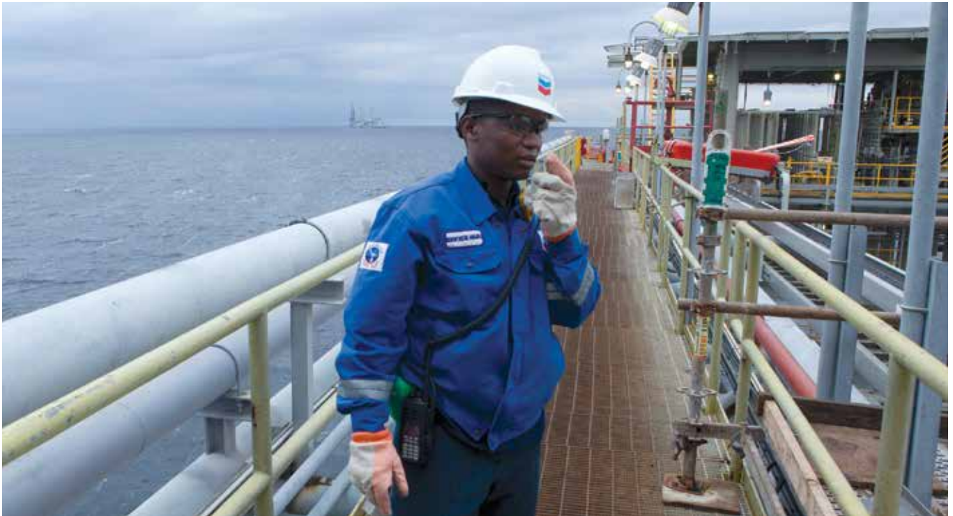
At Chevron, following safety procedures is vital at all times.