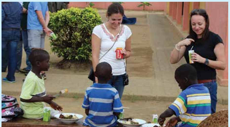
Volunteers talk with children at Zenze do Lucula orphanage for boys where the CVOP donated a generator.