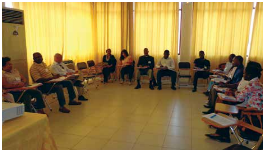
Professionals received training to improve their business at the Business Resource Center in Cabinda.

The project has directly benefited 25 business owners, six of which are women.