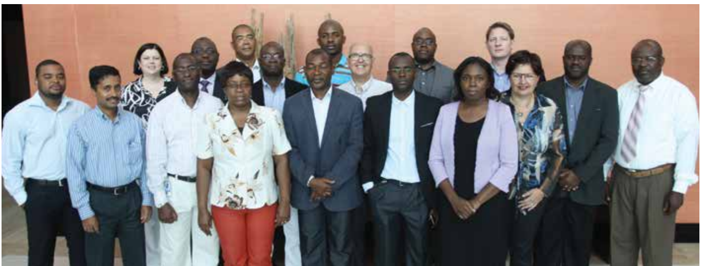
The 2013 Leadership Forum provided opportunities to strengthen Chevron's potential future leaders.

As a result of participation in these fairs, Chevron made 74 job offers and extended 16 internships to qualified students and professionals. The areas available were predominantly technical and included asset development, asset management, drilling, information technology and operations.