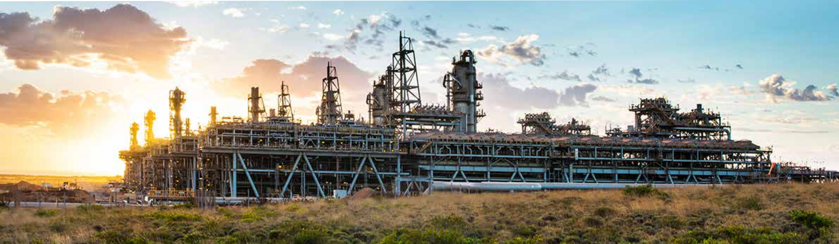
Photo above depicts the Gorgon LNG project, home to the world's largest integrated carbon capture, injection and storage project.

delivering sustainable energy the chevron way